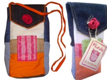
Packaging for coffee sold in the Juan Valdez stores.

Inversiones Éthel S. A. S. – Exclusive aprons, rugs, cushions, handbags, mobiles and necessities, sold under the Éthel brand in Medellín, Bogotá, Barranquilla, Cali and Manizales.